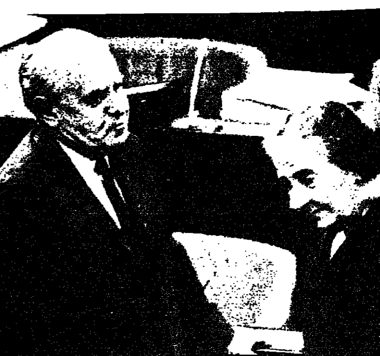
Ya'acov Shimshon Shapiro with the Prime Minister before Mrs. Meir announced his resignation in the Knesset two months ago.